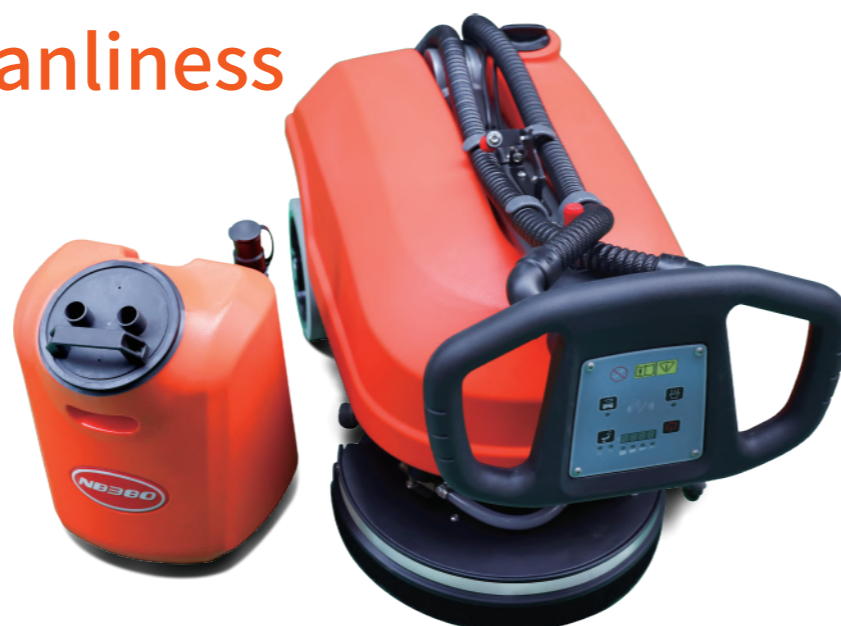
Clean water tank separation, cleaning and maintenance more convenient.

The new NOBLELIFT NB380 combines high performance with ease of use in a compact design. With a working width of 380mm, floors can be cleaned quickly, efficiently and thoroughly with a disc brush or pad. Many well-thought-out details support the user in his daily work. For example, the ergonomically shaped, the good accessibility of all components facilitating daily maintenance or the cover of the solution tank filler neck, which acts as a dosing aid for cleaning chemicals.