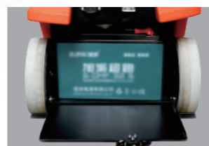
Low energy consumption control system, one full charge can keep machine running 1.5~2 hours with standard 24V32AH lead-acid battery.