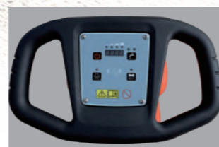
Integrated waterproof touch panel design, easy and fast operation.

The buckle -type brush is replaced with simple and convenient; the front skirt brush design to prevent the brush of the brushing out of water; the V -type squeegee design to avoid sewage overflow.