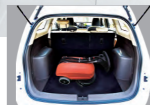
Foldable handle design for less storage space.